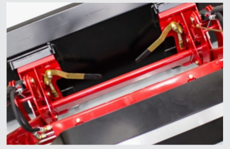
Quick attach skid steer style loader couplers are standard on all 4500 series loaders for ultra-fast front implement attachment.