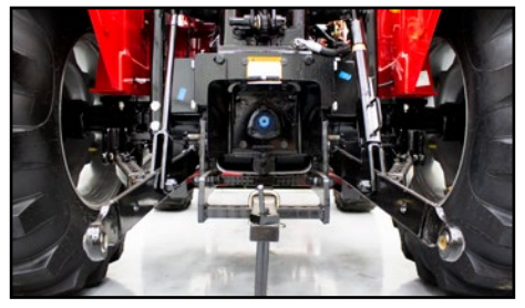
Changeable category I & II 3-point hitch with telescopic stabilizers