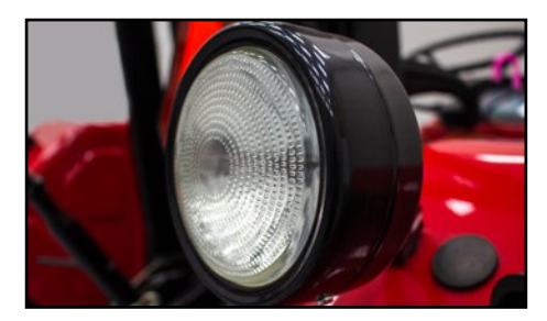
Optional rear worklight for low light conditions