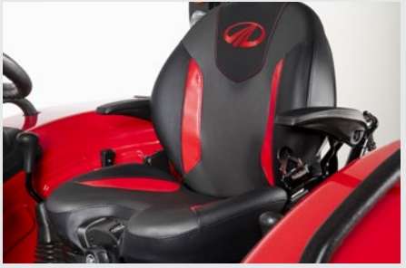
mComfort Mechanical Suspension Seat designed for maximum comfort and convenience, these mComfort seats come equipped with retractable seat belt, arm rests, and rainwater drain as standard.